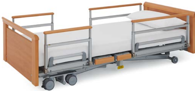
Model 5384 Kepler